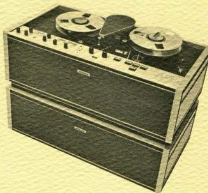
VPR-7900 with TBC-790 (below in typical configuration)

Descriptions and specifications subject to change without notice.